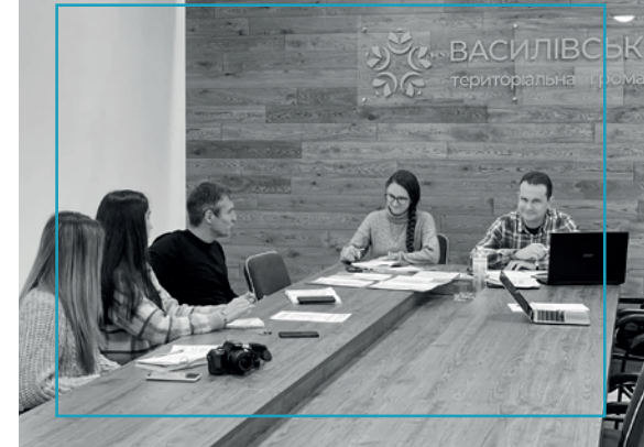
Strategic meeting with Vasylivka local development agency, January 2022