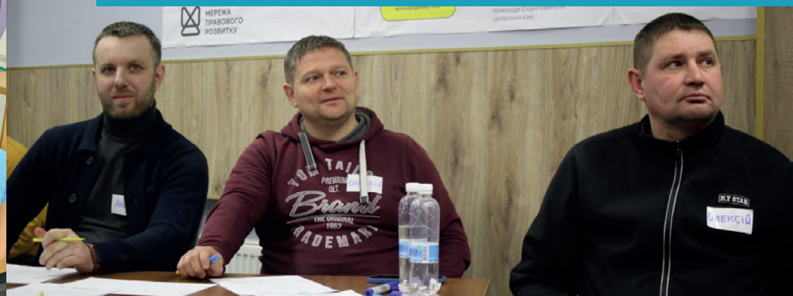
Photos on page 13: Halyna Kolesnyk/LDN/General meeting of the Legal Development Network