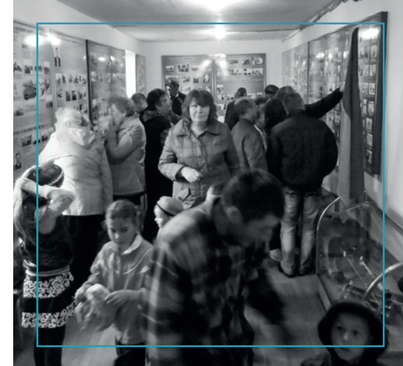
Both IDPs and local residents received help through psychological support groups

3 social spaces equipped for temporary accommodation of IDPs (purchased kettles, microwaves, multicookers, sleeping kits)