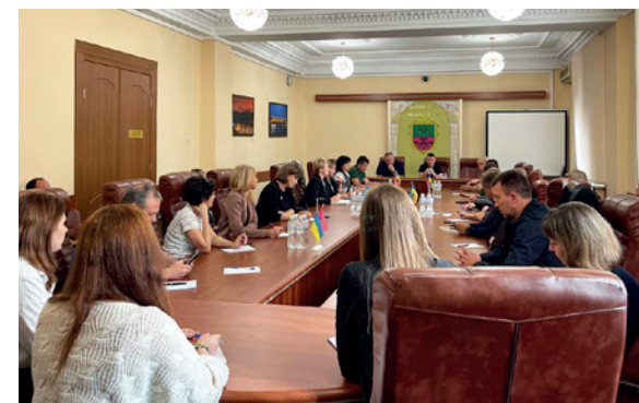
Round table for relocated communities in Zaporizhzhia city hall